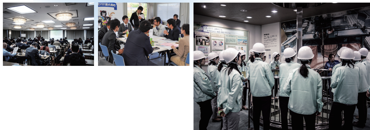
Site tour to nuclear facilities

To help people better understand the benefits and potential of nuclear energy, including its significant contributions on climate change issues and toward sustainable development of society for future generations, JAIF provides timely information by using various media and hosting symposiums on a regular basis. A particular current focus of activities by JAIF and its member companies is the restoration of public confidence in nuclear energy lost as a result of the accident at the Fukushima Daiichi NPPs.