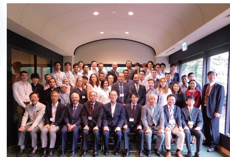
Japan-IAEA NEMS organized by JN-HRD.Net